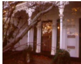
h01831 terrace kerferd rd albert park ac2 june1999