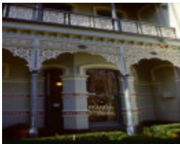
h01831 terrace kerferd rd albert park 33 ac2 june1999