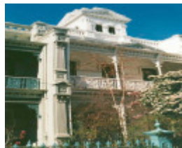
31 Kerferd Road