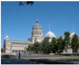
ROYAL EXHIBITION BUILDING AND CARLTON GARDENS (WORLD HERITAGE PLACE) SOHE 2008