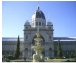
royal exhibition buildings nicholson street carlton front view aug1985