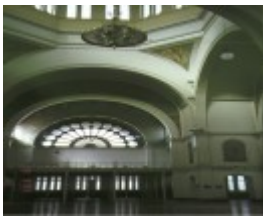
royal exhibition buildings nicholson street carlton dome interior