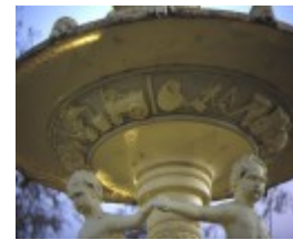
royal exhibition buildings nicholson street carlton fountain detail