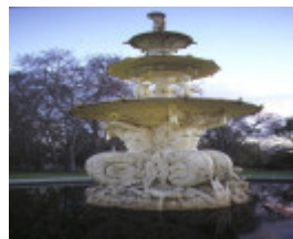
royal exhibition buildings nicholson street carlton fountain front view