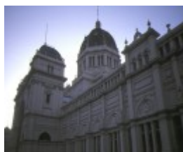
royal exhibition buildings nicholson street carlton side elevation