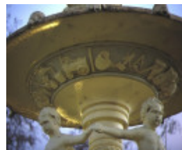
royal exhibition buildings nicholson street carlton fountain detail