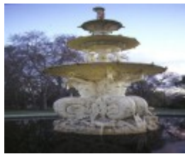
royal exhibition buildings nicholson street carlton fountain front view