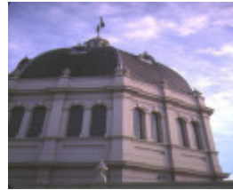
royal exhibition buildings nicholson street carlton dome detail