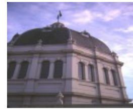
royal exhibition buildings nicholson street carlton dome detail