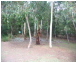
Manningham Heritage Garden & Significant Tree Study 2006