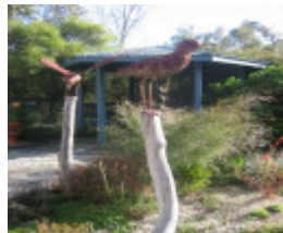
Manningham Heritage Garden & Significant Tree Study 2006