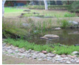
Manningham Heritage Garden & Significant Tree Study 2006