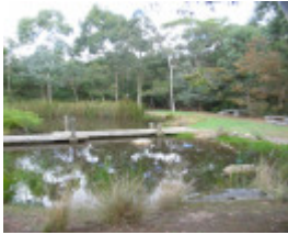
Manningham Heritage Garden & Significant Tree Study 2006