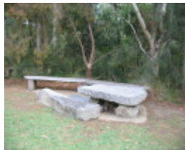
Manningham Heritage Garden & Significant Tree Study 2006