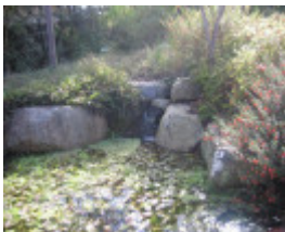
Manningham Heritage Garden & Significant Tree Study 2006