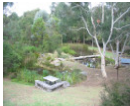
Manningham Heritage Garden & Significant Tree Study 2006