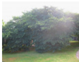
Manningham Heritage Garden & Significant Tree Study 2006