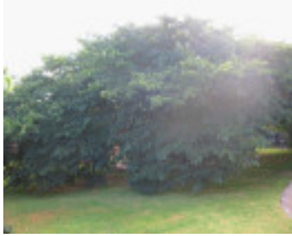
Manningham Heritage Garden & Significant Tree Study 2006