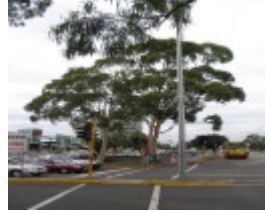
Manningham Heritage Garden & Significant Tree Study 2006