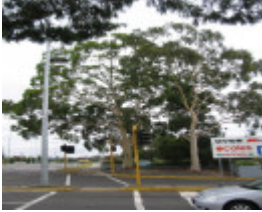
Manningham Heritage Garden & Significant Tree Study 2006