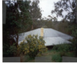
22960 House - 165 Brackenbury Street, Warrandyte (C)