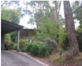
22960 House - 165 Brackenbury Street, Warrandyte (318 Yarra)_1