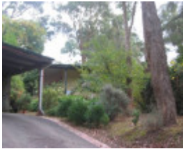
22960 House - 165 Brackenbury Street, Warrandyte (318 Yarra)_1