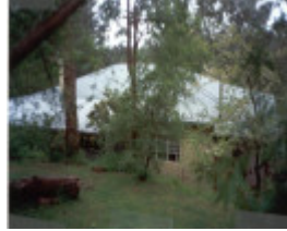
22960 House - 165 Brackenbury Street, Warrandyte (B)