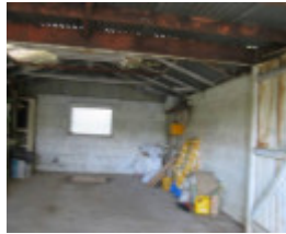
22960 Garage - 165 Brackenbury Street, Warrandyte (1)