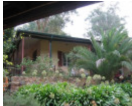
22960 House - 165 Brackenbury Street, Warrandyte (318 Yarra)_2