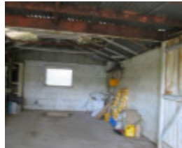
22960 Garage - 165 Brackenbury Street, Warrandyte (1)