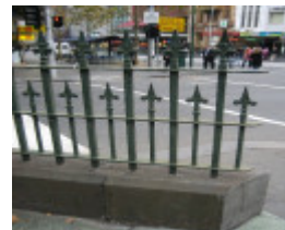
H2108 Underground Toilets Melbourne 08 06 06 mz 048