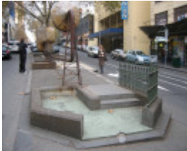
H2108 Underground Toilets Melbourne 08 06 06 mz 039