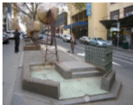
H2108 Underground Toilets Melbourne 08 06 06 mz 039