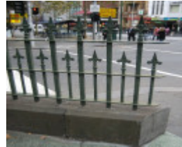
H2108 Underground Toilets Melbourne 08 06 06 mz 048