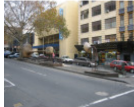
H2108 Underground Toilets Melbourne 08 06 06 mz 050