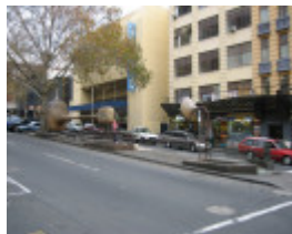
H2108 Underground Toilets Melbourne 08 06 06 mz 050