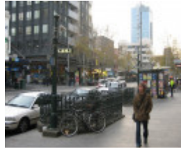
Underground men's toilet Elizabeth St GPO 08 06 06 mz 026