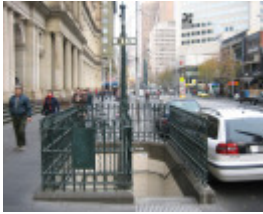
Underground men's toilet Elizabeth St GPO 08 06 06 mz 036