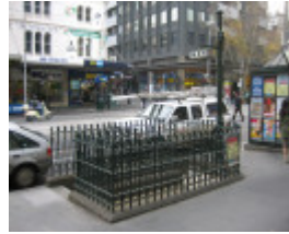
Underground men's toilet Elizabeth St GPO 08 06 06 mz 028