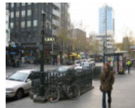
Underground men's toilet Elizabeth St GPO 08 06 06 mz 026