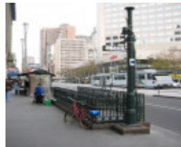
23086 Underground women's toilet Elizabeth St GPO 08 06 06 mz 023