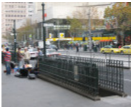
Underground women's toilet Elizabeth St GPO 08 06 06 mz 025