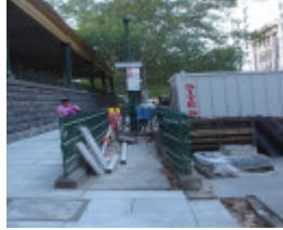
Underground public toilets_Flinders Street_April 2007_view from east