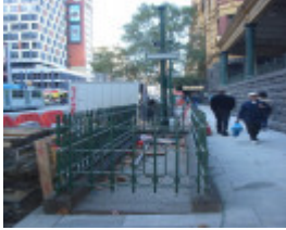
Underground public toilet_Flinders Street_April 2007_view from west