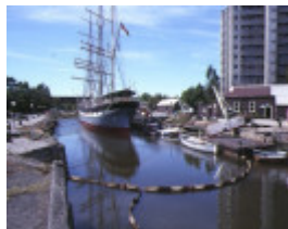
1 duke & orr's dry dock lorimer street south melbourne dock entrance jan1989