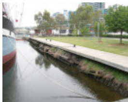
DUKE AND ORR'S DRY DOCK SOHE 2008