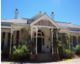
H0361 Kongbool Balmoral entrance 2341