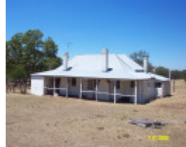
H0361 Kongbool Balmoral 1st 2345