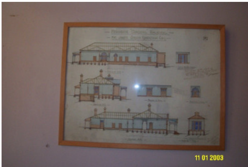
H0361 Kongbool Balmoral architect s dwgs 2375