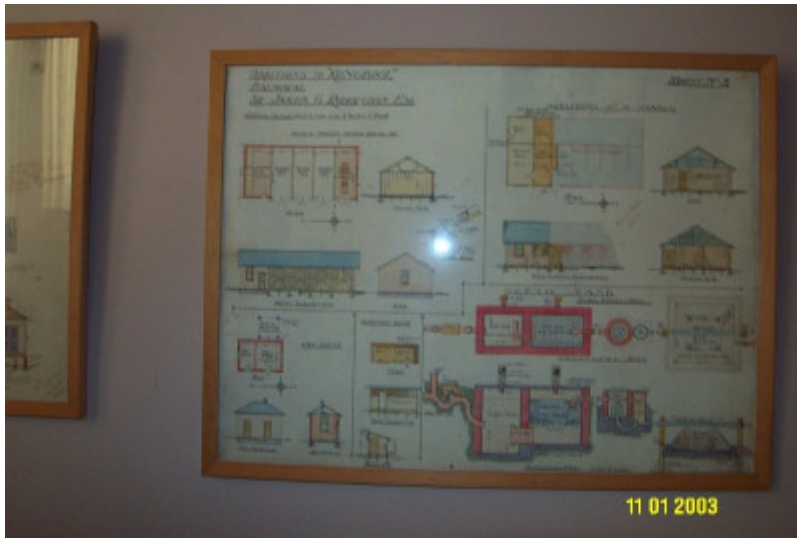
H0361 Kongbool Balmoral architect s dwgs 2374