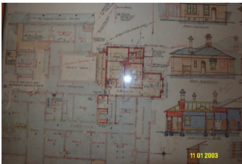
H0361 Kongbool Balmoral architect s dwgs 2376