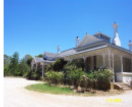
H0361 Kongbool Balmoral facade 2344