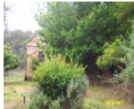
23162 Spring Vale brick section garden 0232