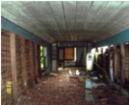
23162 Springvale Coojar 0223