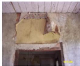
23162 Spring Vale brick section nogging 0235