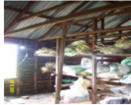
23162 Spring Vale 0239