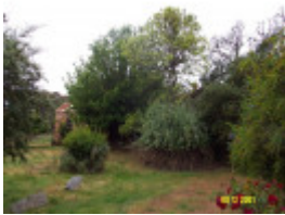
23162 Spring Vale brick section and garden 0230