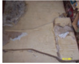
23162 Springvale Coojar brick section 0220