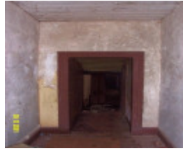
23162 Springvale Coojar brick section 0221