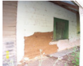
23162 Springvale Coojar pise section 0208