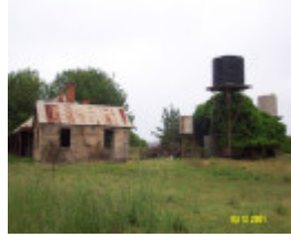
23162 Spring Vale former PO laundry 0241