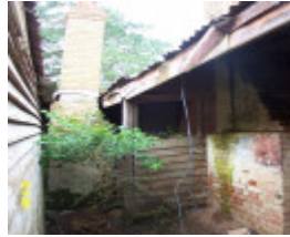
23162 Spring Vale 0238