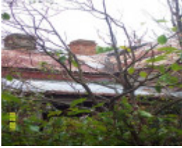
23162 Spring Vale drawing dining rooms 0247