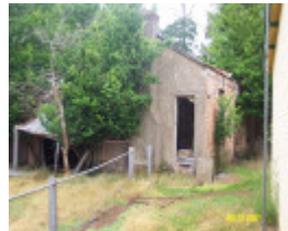
23162 Spring Vale brick section 0234