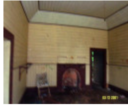
23162 Springvale Coojar timber section 0225