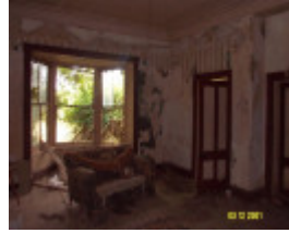
23162 Springvale Coojar drawing room 0215