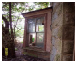
23162 Spring Vale dining room bay window 0229