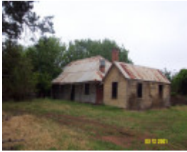
23162 Springvale 0201