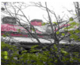
23162 Spring Vale detail of chimneys 0246