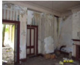
23162 Springvale Coojar brick section 0214