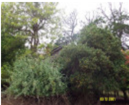
23162 Spring Vale garden 0231