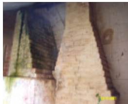
23162 Spring Vale Kitchen chimneys 0237