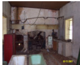
23162 Springvale Coojar pise section 0206