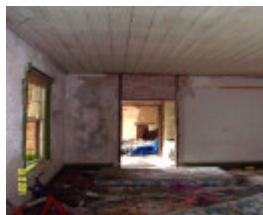
23162 Springvale Coojar brick section 0217