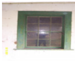
23162 Springvale Coojar pise section 0205