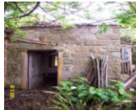
23162 Springvale Coojar stone section 0211