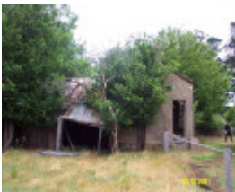
23162 Springvale Coojar outbuildings 0210