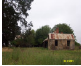
23162 Spring Vale former PO 0240