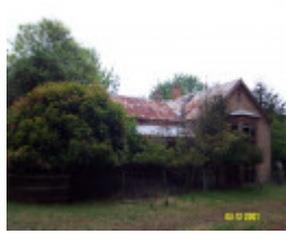
23162 Spring Vale drawing dining rooms 0244