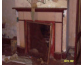
23162 Springvale Coojar mantelpiece 0224