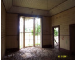
23162 Springvale Coojar dining room 0226