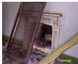
23162 Springvale Coojar brick section 0218