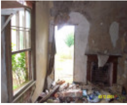
23162 Springvale Coojar brick section 0219