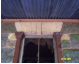
23162 Springvale Coojar stone section 0227