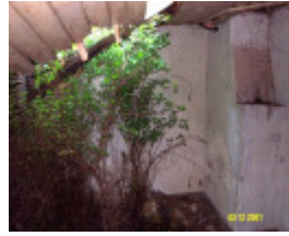
23162 Springvale Coojar timber section 0222