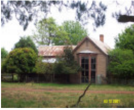
23162 Spring Vale drawing dining rooms 0242