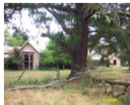
23162 Spring Vale dining room former PO 0243