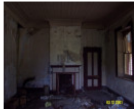
23162 Springvale Coojar stone section 0213