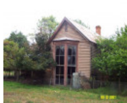
23162 Springvale Coojar 0202