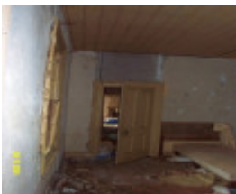
23162 Springvale Coojar brick section 0216