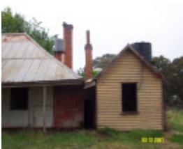
23162 Springvale Coojar Post Office 0203