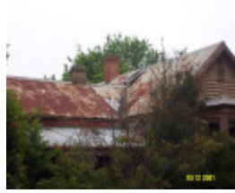
23162 Spring Vale drawing dining rooms 0245