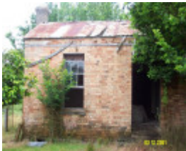
23162 Spring Vale brick section 0233