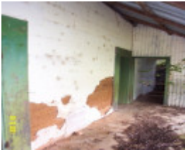
23162 Springvale Coojar pise section 0207