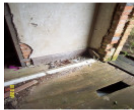
23162 Spring Vale brick section door detail 0236