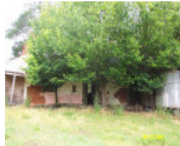
23162 Springvale Coojar pise section 0209