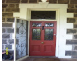
23189 Brisbane Hill front door 0302