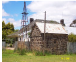
23189 Brisbane Hill outbuilding 0291