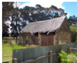
23189 Brisbane Hill stables 0290