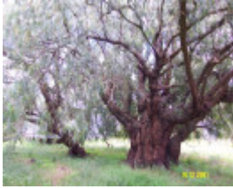
23189 Brisbane Hill trees south side 0295