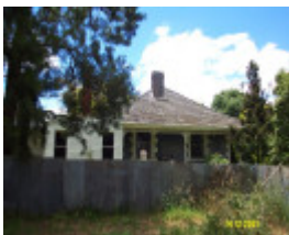
23189 Brisbane Hill south side 0294