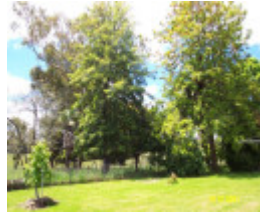
23189 Brisbane Hill trees north side 0301