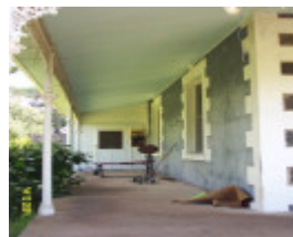
23189 Brisbane Hill south verandah 0287