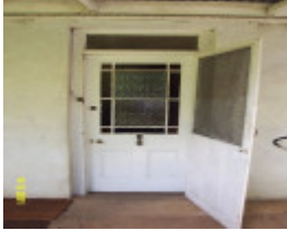
23189 Brisbane Hill back door 0298