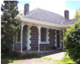
23189 Brisbane Hill north verandah 0286