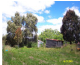
23189 Brisbane Hill outbuildings 0293