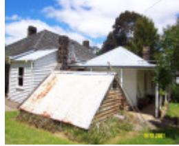
23189 Brisbane Hill north side 0289