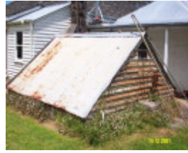
23189 Brisbane Hill tank 0300