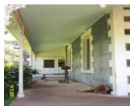
23189 Brisbane Hill south verandah 0287