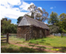
23189 Brisbane Hill stables 0292