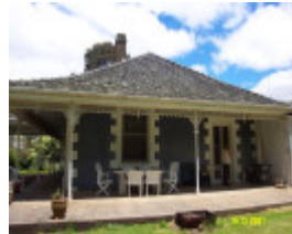
23189 Brisbane Hill north verandah 0288