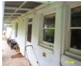
23189 Brisbane Hill rear elevation 0297