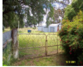
23189 Brisbane Hill trees south side 0296