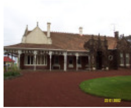
23192 Bassett Homestead Branxholme front elevation 1405