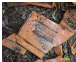
23192 Bassett Homestead Branxholme roof tile 1408