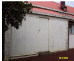
23192 Bassett Homestead Branxholme rear elevation 1416