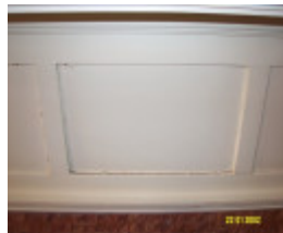
23192 Bassett Homestead Branxholme front hall mantel 1387