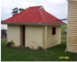
23192 Bassett Homestead Branxholme dairy 1395