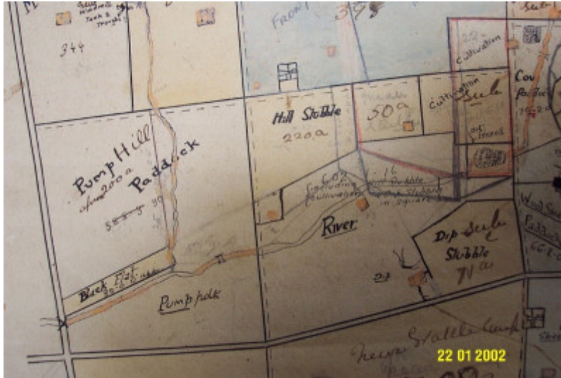
23192 Bassett Homestead Branxholme estate map 1379