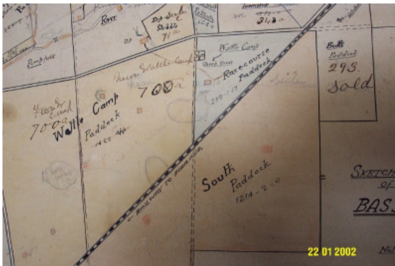
23192 Bassett Homestead Branxholme estate map 1380