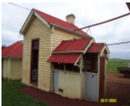
23192 Bassett Homestead Branxholme meat house 1394