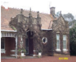
23192 Bassett Homestead Branxholme front elevation 1406