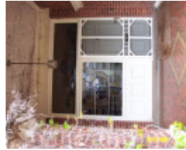
23192 Bassett Homestead Branxholme front door 1422