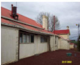
23192 Bassett Homestead Branxholme rear elevation 1417