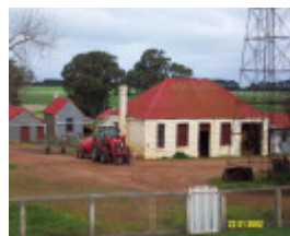
23192 Bassett Homestead Branxholme stables and coachhouse 1398