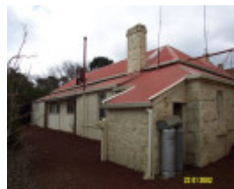
23192 Bassett Homestead Branxholme rear elevation 1418