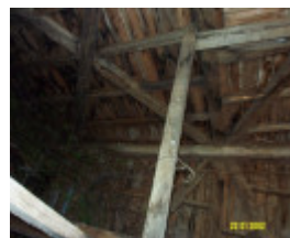
23192 Bassett Homestead Branxholme tank stand 1401