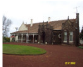
23192 Bassett Homestead Branxholme front elevation 1407