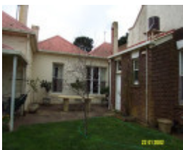
23192 Bassett Homestead Branxholme side elevation 1421