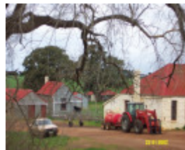
23192 Bassett Homestead Branxholme milking shed 1399