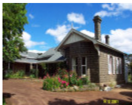
23196 Clifton Homestead 0317