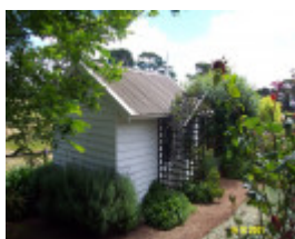
23196 Clifton Homestead outbuilding 0320