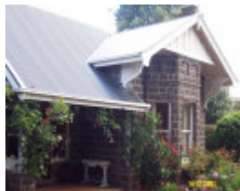
23196 Clifton Homestead 0315