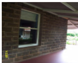
23196 Clifton Homestead original house 0313