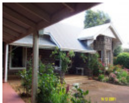
23196 Clifton Homestead 0314