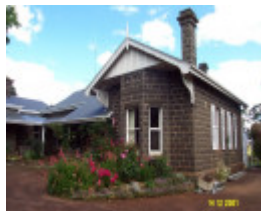
23196 Clifton Homestead 0316