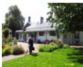
23196 Clifton Homestead rear elevation 0321