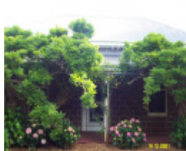
23196 Clifton Homestead original house 0326