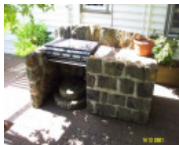
23196 Clifton Homestead old well 0322