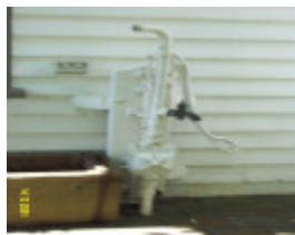
23196 Clifton Homestead old pump 0323