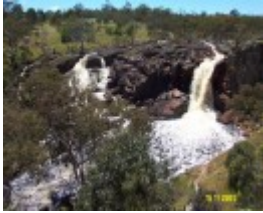
23207 Nigretta Falls 0188