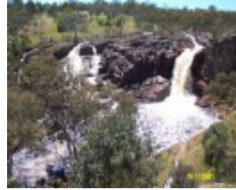
23207 Nigretta Falls 0189