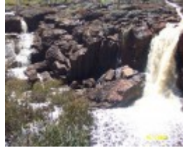
23207 Nigretta Falls 0190