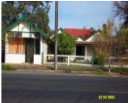
23327 Common School Former 83a b Bell St Penshurst 0804