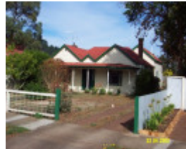
23327 Common School Former 83a b Bell St Penshurst house 0805