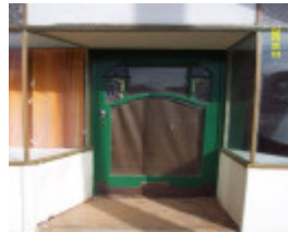
23327 Common School Former 83a b Bell St Penshurst shop d 0806