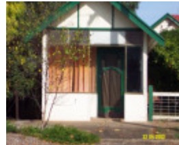
23327 Common School Former 83a b Bell St Penshurst shop 0803