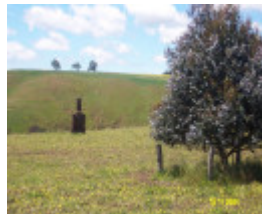
23400 Riverside original site 0174