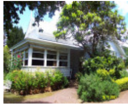
23400 Riverside garden entrance 0181