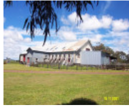
23400 Riverside woolshed 0177