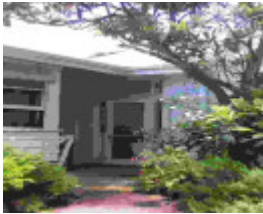
23400 Riverside garden entrance 0180