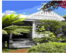
23400 Riverside garden entrance 0183