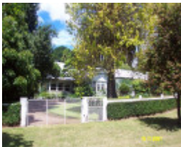
23400 Riverside main entrance 0184