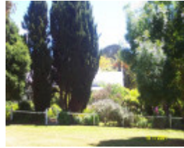
23400 Riverside Garden 0178