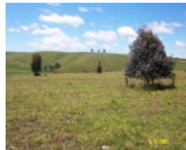
23400 Riverside original site 0173