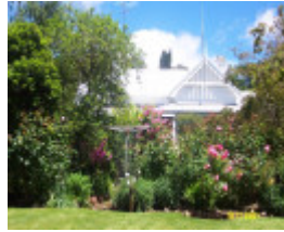
23400 Riverside Garden 0179