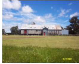
23400 Riverside Woolshed 0176