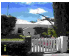
23400 Riverside side entrance 0186