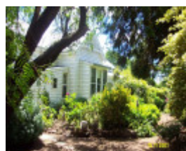
23400 Riverside side garden 0187