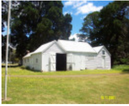
23400 Riverside stables 0185