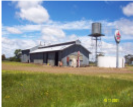
23400 Riverside Barn 0175