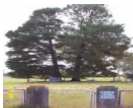
23417 Memorial Gates Mooralla 1181