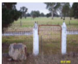
23417 Memorial Plaque Mooralla 1178