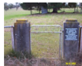
23417 Memorial Gates Mooralla 1179