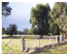
23417 Memorial Gates Mooralla 1182