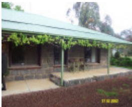
23418 Stirling Homestead Glenthompson new front verandah 1682