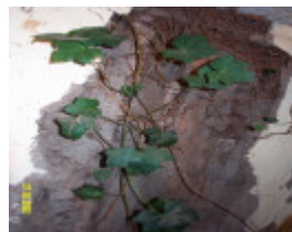
23418 Stirling Homestead Glenthompson dairy 1684