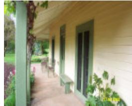
23418 Stirling Homestead Glenthompson front verandah 1680