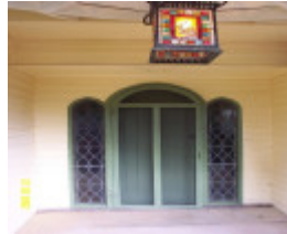
23418 Stirling Homestead Glenthompson new front door 1679