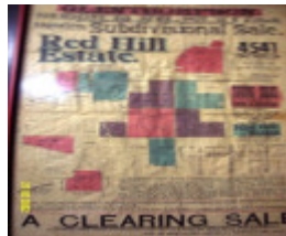
23418 Stirling Homestead Glenthompson sale plan 1695