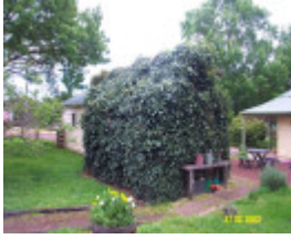
23418 Stirling Homestead Glenthompson dairy 1691