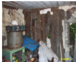
23418 Stirling Homestead Glenthompson dairy 1685