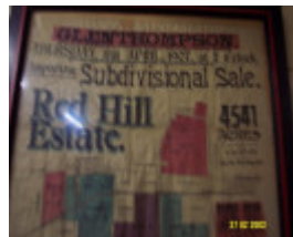
23418 Stirling Homestead Glenthompson sale plan 1697