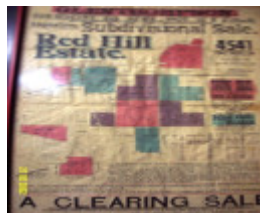
23418 Stirling Homestead Glenthompson sale plan 1695