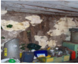
23418 Stirling Homestead Glenthompson dairy 1686