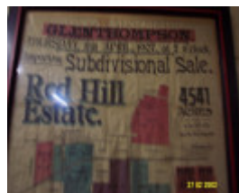
23418 Stirling Homestead Glenthompson sale plan 1697