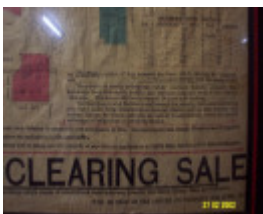
23418 Stirling Homestead Glenthompson sale plan 1696