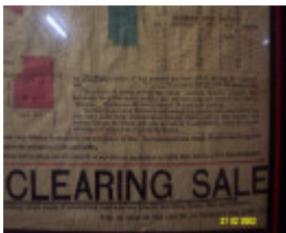
23418 Stirling Homestead Glenthompson sale plan 1696