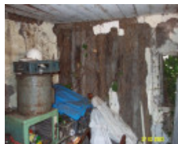
23418 Stirling Homestead Glenthompson dairy 1685