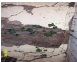
23418 Stirling Homestead Glenthompson dairy 1683