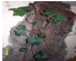
23418 Stirling Homestead Glenthompson dairy 1684