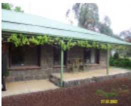
23418 Stirling Homestead Glenthompson new front verandah 1682