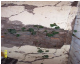
23418 Stirling Homestead Glenthompson dairy 1683