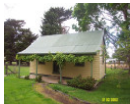
23418 Stirling Homestead Glenthompson railway cottage 1694