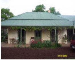
23418 Stirling Homestead Glenthompson facade 1681