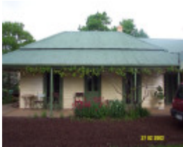
23418 Stirling Homestead Glenthompson facade 1681