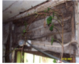
23418 Stirling Homestead Glenthompson dairy 1688