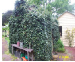
23418 Stirling Homestead Glenthompson dairy 1690