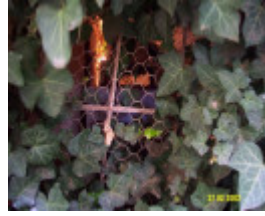
23418 Stirling Homestead Glenthompson dairy 1693