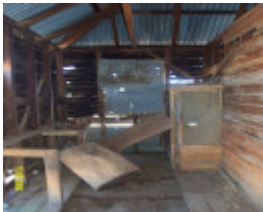
23424 Englefield Balmoral former men s quarters 2330