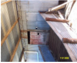
23424 Englefield Balmoral former woolshed 2324