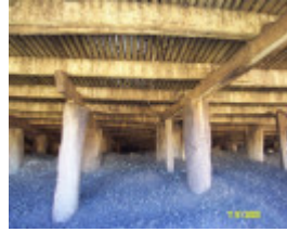
23424 Englefield Balmoral former woolshed stumps 2326