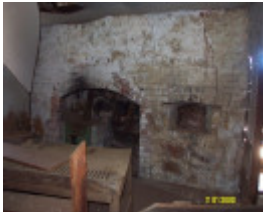
23424 Englefield Balmoral former men s quarters 2327