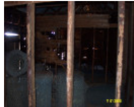
23424 Englefield Balmoral former men s quarters 2328