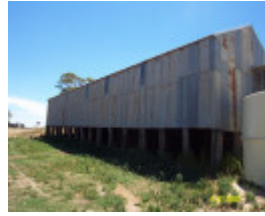
23424 Englefield Balmoral former woolshed 2325