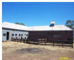
23424 Englefield Balmoral former woolshed 2323