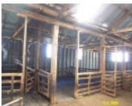
23424 Englefield Balmoral former woolshed 2318