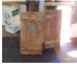
23424 Englefield Balmoral former woolshed gates 2321