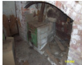
23424 Englefield Balmoral former men s quarters 2331