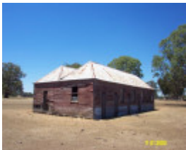
23424 Englefield Balmoral former men s quarters 2334