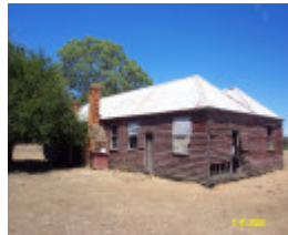
23424 Englefield Balmoral former men s quarters 2333