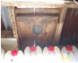
23424 Englefield Balmoral former woolshed gateway 2322