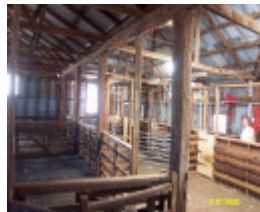
23424 Englefield Balmoral former woolshed 2319