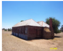
23424 Englefield Balmoral former men s quarters 2335