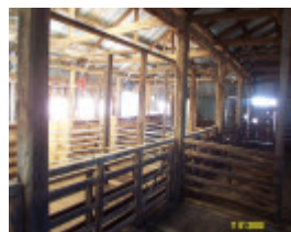
23424 Englefield Balmoral former woolshed 2320