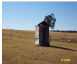
23434 Glendinning Homestead Balmoral woolshed dunny 2145