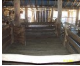
23434 Glendinning Homestead Balmoral woolshed 2142