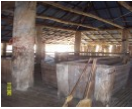
23434 Glendinning Homestead Balmoral woolshed 2141