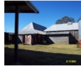
23434 Glendinning Homestead Balmoral woolshed 2148