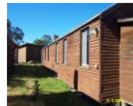
23434 Glendinning Homestead Balmoral men s quarters 2151