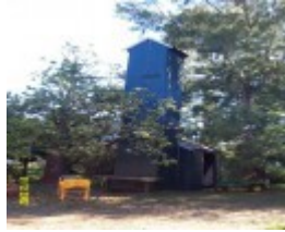
23434 Glendinning Homestead Balmoral carbide tower 2135