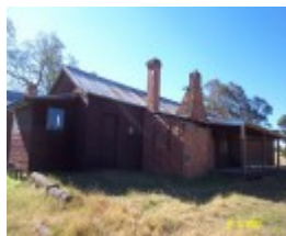
23434 Glendinning Homestead Balmoral men s quarters 2150