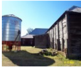
23434 Glendinning Homestead Balmoral woolshed 2147