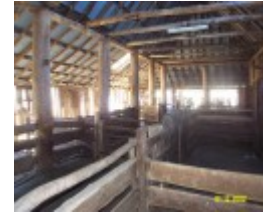
23434 Glendinning Homestead Balmoral woolshed 2143