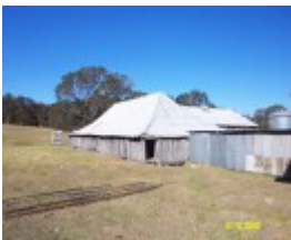
23434 Glendinning Homestead Balmoral woolshed 2149