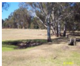
23434 Glendinning Homestead Balmoral sheep dip 2144