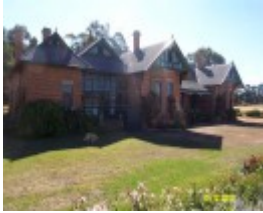
23434 Glendinning Homestead Balmoral facade 2132