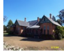
23434 Glendinning Homestead Balmoral facade 2133