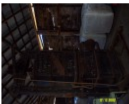
23434 Glendinning Homestead Balmoral woolpress 2137