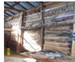
23434 Glendinning Homestead Balmoral woolshed slabs 2139