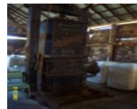
23434 Glendinning Homestead Balmoral woolpress 2138