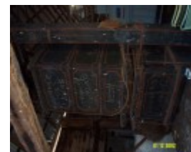
23434 Glendinning Homestead Balmoral woolpress 2136