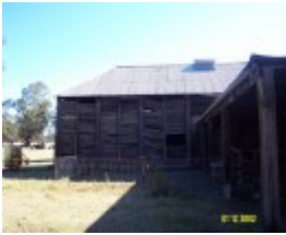
23434 Glendinning Homestead Balmoral woolshed 2146