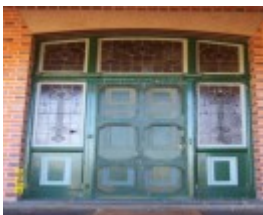
23434 Glendinning Homestead Balmoral front door 2134