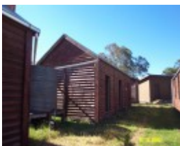
23434 Glendinning Homestead Balmoral men s quarters 2152