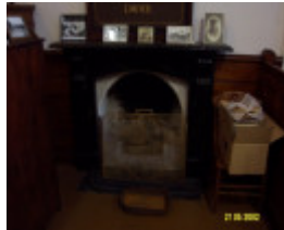
23437 Courthouse Former Martin St Penshurst interior 1030