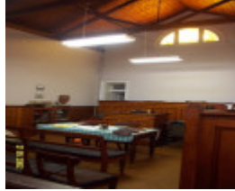
23437 Courthouse Former Martin St Penshurst interior 1027