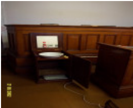
23437 Courthouse Former Martin St Penshurst interior 1031