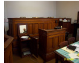
23437 Courthouse Former Martin St Penshurst interior 1032