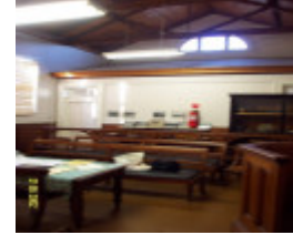
23437 Courthouse Former Martin St Penshurst interior 1028