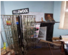
23437 Courthouse Former Martin St Penshurst interior 1033