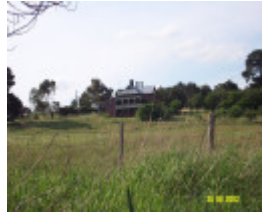
23480 Myrning Wootong Vale 1994