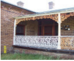
23480 Myrning Wootong Vale verandah 1997