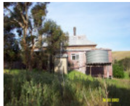
23480 Myrning Wootong Vale rear elevation 2005