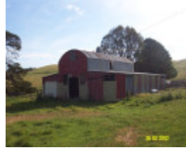
23480 Myrning Wootong Vale woolshed 2006