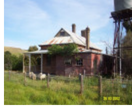
23480 Myrning Wootong Vale 1995