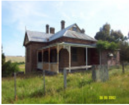
23480 Myrning Wootong Vale 1996