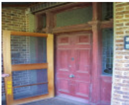
23480 Myrning Wootong Vale front door 2000