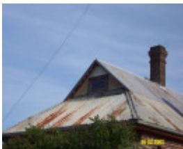
23480 Myrning Wootong Vale roof detail 2007