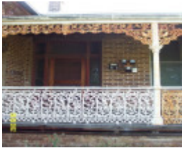
23480 Myrning Wootong Vale 1998