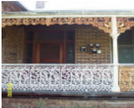
23480 Myrning Wootong Vale 1998