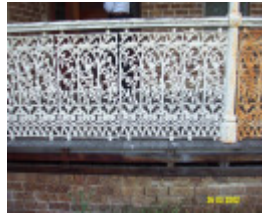
23480 Myrning Wootong Vale cast iron 1999