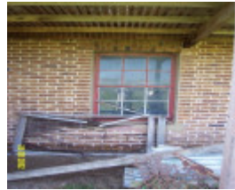
23480 Myrning Wootong Vale basement window 2003