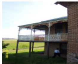
23480 Myrning Wootong Vale side verandah 2002