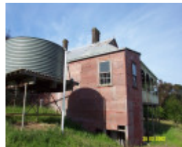
23480 Myrning Wootong Vale pressed metal wing 2004