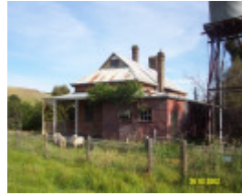
23480 Myrning Wootong Vale 1995