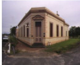
1 bank of victoria bay street port albert front view