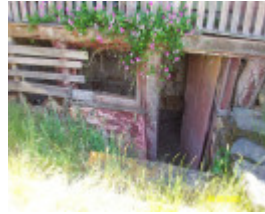
23526 Hillview Nareen cellar 1964