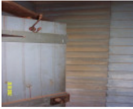
23526 Hillview Nareen verandah bathroom 1977