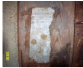
23526 Hillview Nareen press clipping 1959