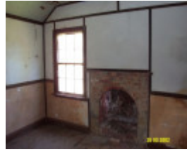
23526 Hillview Nareen interior 1974