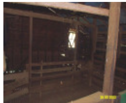
23526 Hillview Nareen former Tarrayoukyan SS 1957