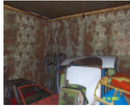
23526 Hillview Nareen interior 1978