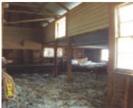
23526 Hillview Nareen former Tarrayoukyan SS 1955