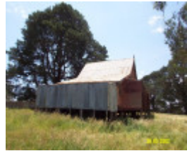
23526 Hillview Nareen former Tarrayoukyan SS 1953