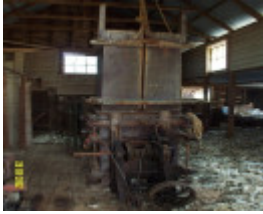
23526 Hillview Nareen woolpress 1954