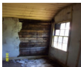
23526 Hillview Nareen interior 1969