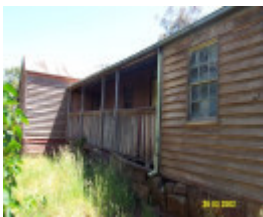
23526 Hillview Nareen verandah 1965