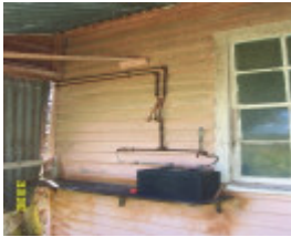
23526 Hillview Nareen electrical system 1982