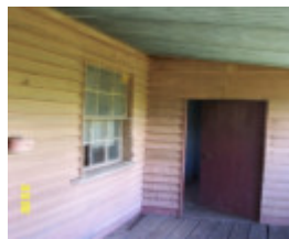
23526 Hillview Nareen verandah 1968