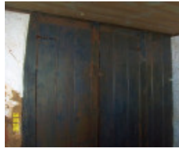
23526 Hillview Nareen cupboard 1980