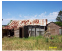
23526 Hillview Nareen rear elevation 1984