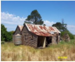
23526 Hillview Nareen rear elevation 1985