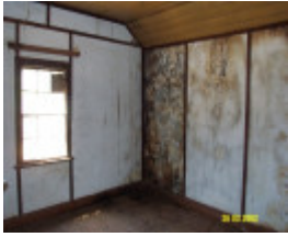
23526 Hillview Nareen interior 1971