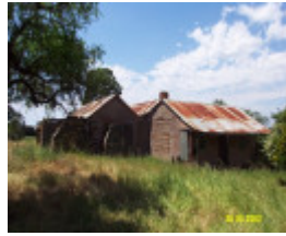
23526 Hillview Nareen south west view 1963