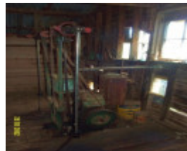
23526 Hillview Nareen former Tarrayoukyan SS 1956