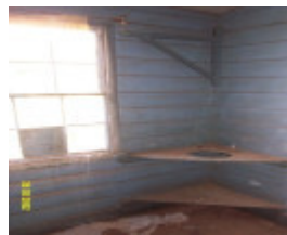
23526 Hillview Nareen verandah bathroom 1976