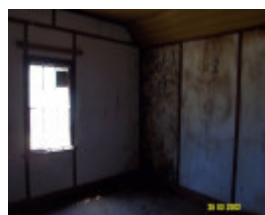
23526 Hillview Nareen interior 1970