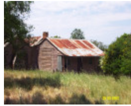
23526 Hillview Nareen second wing 1962