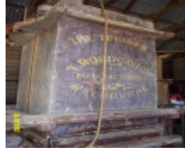
23526 Hillview Nareen woolpress 1958