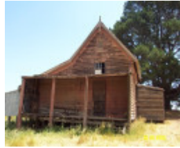
23526 Hillview Nareen former Tarrayoukyan SS 1952