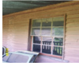
23526 Hillview Nareen window 1967