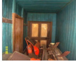
23526 Hillview Nareen interior hall 1981