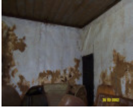
23526 Hillview Nareen interior 1979