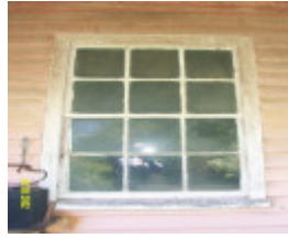
23526 Hillview Nareen window detail 1983