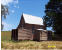
23526 Hillview Nareen former Tarrayoukyan SS 1951