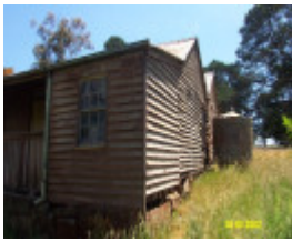
23526 Hillview Nareen north side 1966