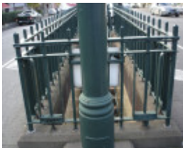
Underground toilet_Carlton_April 2007_railing detail