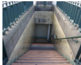
Underground toilet_Carlton_April 2007_ladies' stair