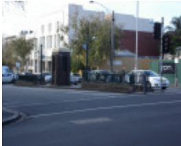
Underground toilet_Carlton_April 2007_view from NW