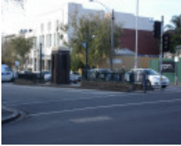
Underground toilet_Carlton_April 2007_view from NW