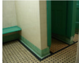
Underground toilet_Carlton_April 2007_interior of ladies'