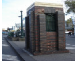
Underground toilet_Carlton_April 2007_ventilator shaft