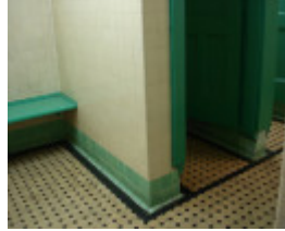
Underground toilet_Carlton_April 2007_interior of ladies'