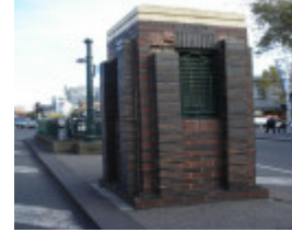
Underground toilet_Carlton_April 2007_ventilator shaft