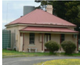
Stony Creek Caretakers cottage