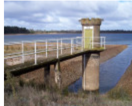
Stony Creek Outlet tower no. 3