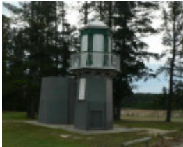
Stony Creek Outlet tower