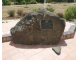
Detail of war memorial, Haddon Memorial Reserve