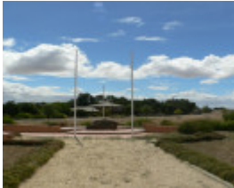
Haddon Memorial Reserve