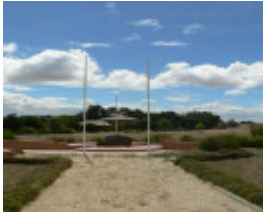
Haddon Memorial Reserve