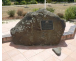
Detail of war memorial, Haddon Memorial Reserve