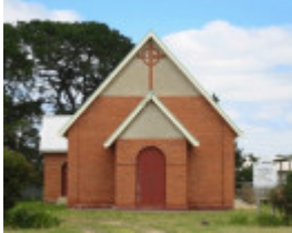
November 2003.