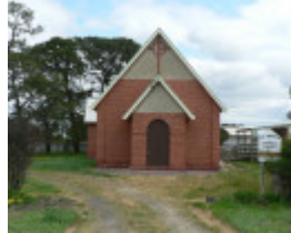
St Mary's Catholic Church, Midland Highway, Lethbridge