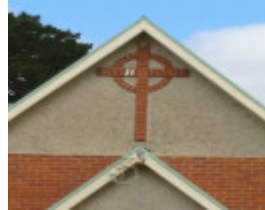
November 2003.