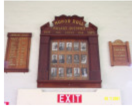
23634 Cavendish Memorial Hall 0137