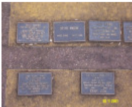
23634 Cavendish Memorial Park 0128