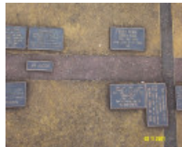
23634 Cavendish Memorial Park 0129