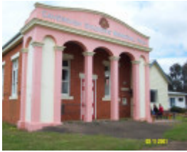
23634 Cavendish Memorial Hall 0132