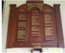
23634 Cavendish Memorial Hall 0138