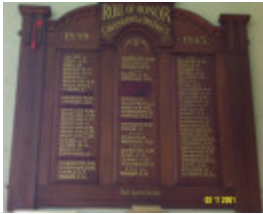
23634 Cavendish Memorial Hall 0139