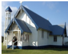
Exterior June 2006