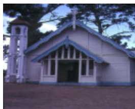
h00999 christ chruuch tyers street tarraville front view feb1982