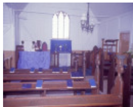
tarraville church tyers street tarraville front interior she project 2004