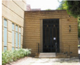
SECOND CHURCH OF CHRIST SCIENTIST SOHO 2008