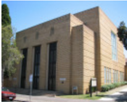
SECOND CHURCH OF CHRIST SCIENTIST SOHO 2008