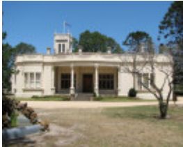
BILLILLA SOHE 2008