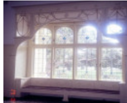
billilla halifax street brighton piano room window she project 2003