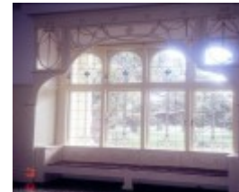
billilla halifax street brighton piano room window she project 2003