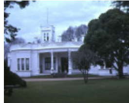
1 billilla brighton front view jun1982