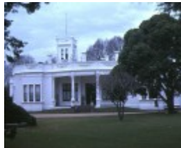
1 billilla brighton front view jun1982