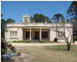
BILLILLA SOHE 2008