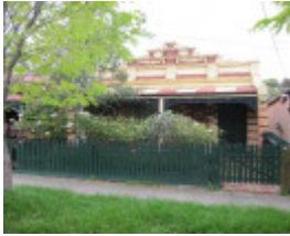
99 Francis Street.JPG