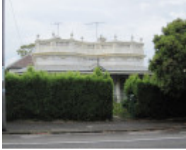
43 Kent Street.JPG