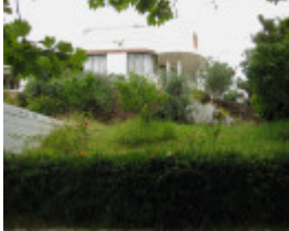
95 Mooltan Street.JPG