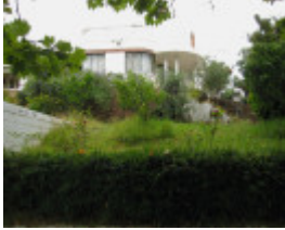
95 Mooltan Street.JPG