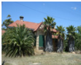
KANIVA RAILWAY STATION SOHE 2008