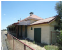
KANIVA RAILWAY STATION SOHE 2008