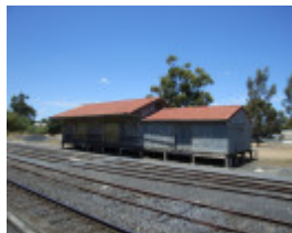
KANIVA RAILWAY STATION SOHE 2008