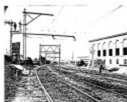
Newmarket railway yards and sub-station during electrification tests (SLV).