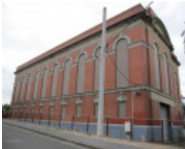
Newmarket Railway Substation.JPG