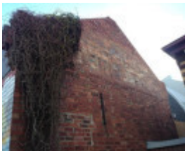
Shoeing forge 258 Racecourse Road