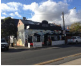
Shoeing forge 258 Racecourse Road