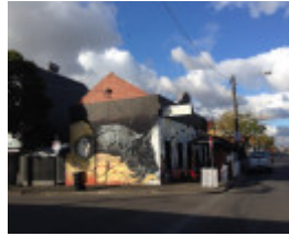
Shoeing forge 258 Racecourse Road