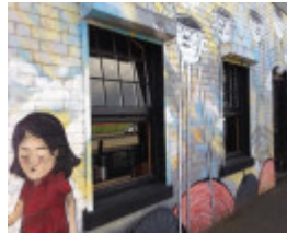
Shoeing forge 258 Racecourse Road