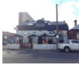
Shoeing forge 258 Racecourse Road