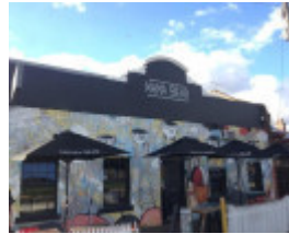
Shoeing forge 258 Racecourse Road