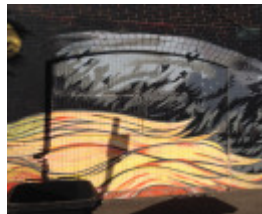
Shoeing forge 258 Racecourse Road