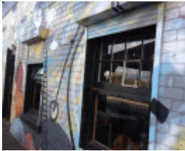
Shoeing forge 258 Racecourse Road