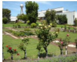
H2101 fletcher jones warrnambool 18nov05 ac garden pond2