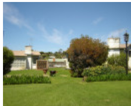
H2101 fletcher jones warrnambool 18nov05 ac RVIA 1