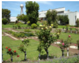
H2101 fletcher jones warrnambool 18nov05 ac garden pond2