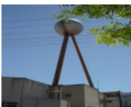
H2101 fletcher jones warrnambool 18nov05 ac water tower