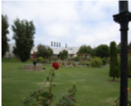
FLETCHER JONES FACTORY AND GARDENS SOHE 2008