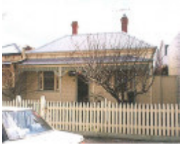
City of Darebin Heritage Review 2000