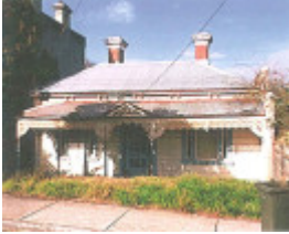
City of Darebin Heritage Review 2000