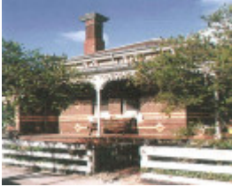
City of Darebin Heritage Review 2000