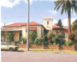
City of Darebin Heritage Review 2000