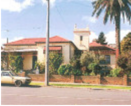
City of Darebin Heritage Review 2000