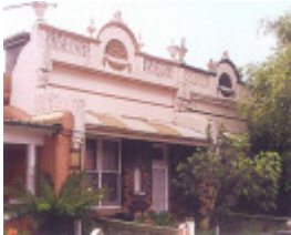
City of Darebin Heritage Review 2000