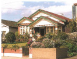
City of Darebin Heritage Review 2000