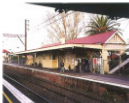
City of Darebin Heritage Review 2000