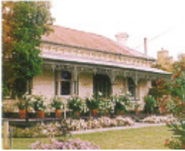
City of Darebin Heritage Review 2000