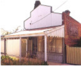
City of Darebin Heritage Review 2000